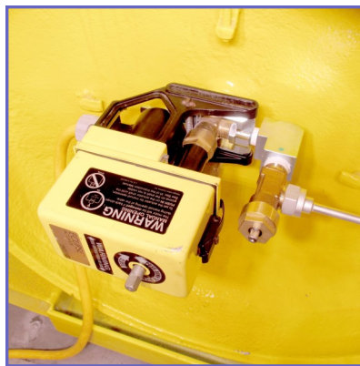
IV-830 with emergency shutoff actuator on a ton container with flexible connector.